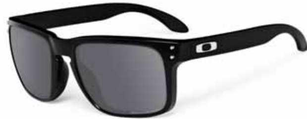
A: Holbrook $120 Polished Black / 24K Gold Iridium*