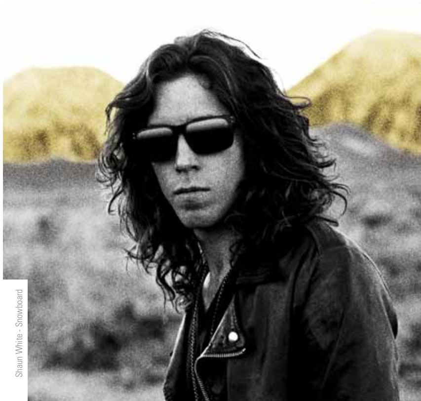
Shaun White - Snowboard