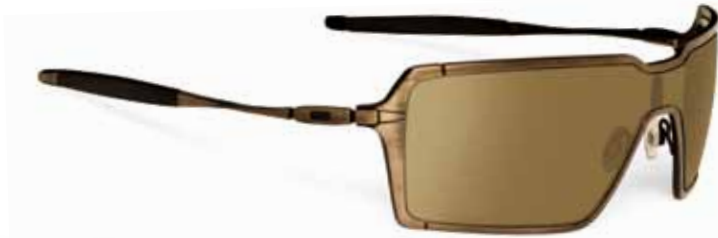
B: Probation $240 Toast / Bronze POLARIZED