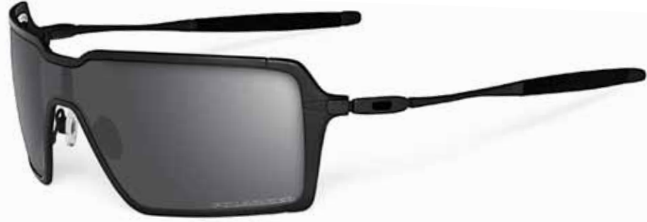
C: Probation $170 Polished Chrome / VR28® Black Iridium®