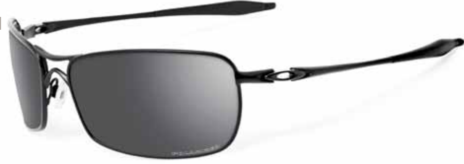
C: Crosshair 2.0 $220 Lead / Black Iridium® POLARIZED