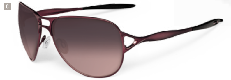
A: Hinder $220 Polished Chrome / Grey POLARIZED B: Hinder $220 Polished Gold / Bronze POLARIZED C: Hinder $170 Matte Berry/ G40™ Black Gradient