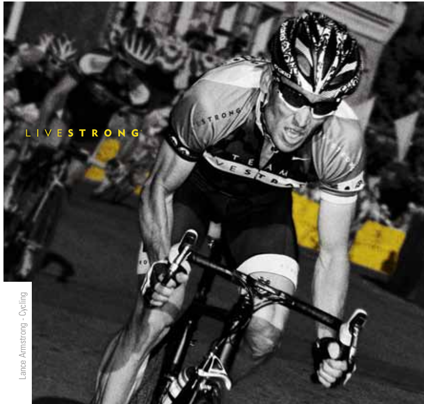
Lance Armstrong - Cycling

Oakley's legacy of sports performance innovation continues with JAWBONE. With Oakley's new SWITCHLOCK™ Technology, the lower part of the frame rim opens to allow easy access for quick lens changing, letting you optimize performance in any light condition. The latest evolution of a coveted design, this frame is like nothing ever seen in the world of sports.