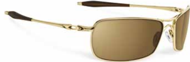
B: Crosshair 2.0 $220 Polished Gold / Bronze POLARIZED