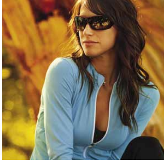
Top: Galaxy Jacket / Sky Blue