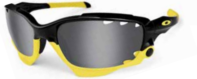
A: Jawbone $260 Polished Black / 00* Red Iridium POLARIZED + Persimmon