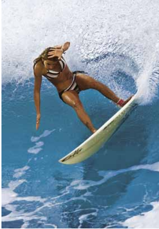
Top: X Bikini / Bottom: X Bikini